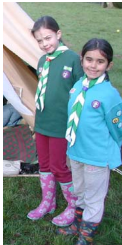
Taken at a Cub Camp 2006

(There may be some other Scouts there that you recognize)